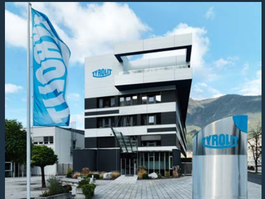
The TYROLIT headquarters in Schwaz, Austria.

Like us on Facebook facebook.com/TYROLIT